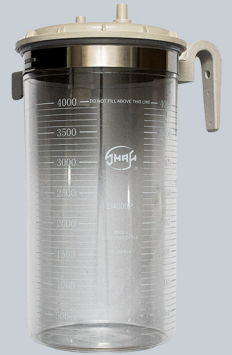
Waste Bottle (N5920)