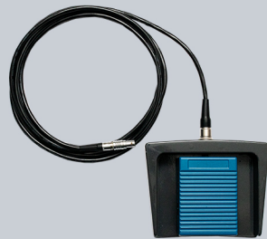
Foot Switch (N5921)