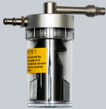
Overflow Bottle (N5920B)