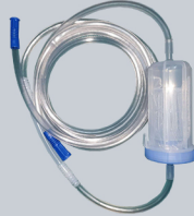
Collection Bottle (P10020202)