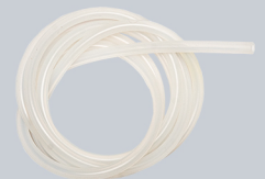
Disposable Tubing Set (N5924)