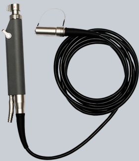
Hand Piece (N5901)