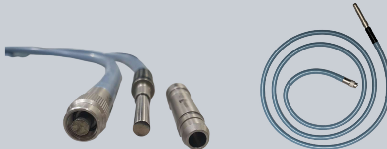
Light Guide Cable with Adaptor (PI85I)